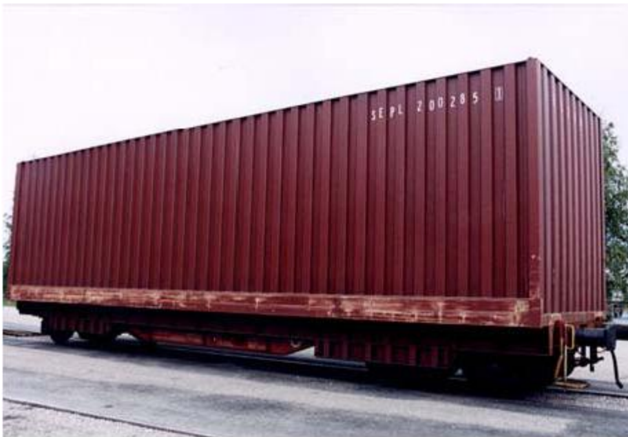
Figure 1. SECU on rail.

The dimensions of the SECUS are 3,6x3,6x13,8 m, and are thus adapted to Sweden's new and larger rail profile "C" with a maximum permitted axle weight of 25 tonnes. A new type of railway bogey has also been developed to accommodate the SECU ( Figure 2 ).