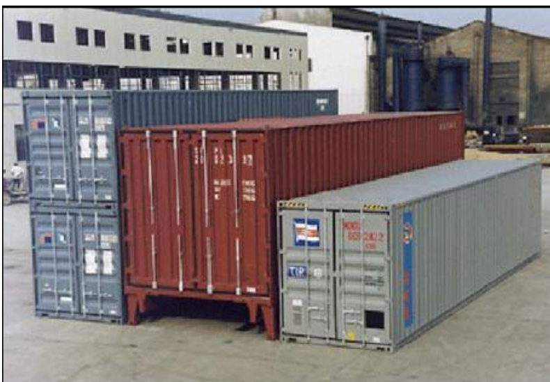
Figure 2. SECU box with standard containers.